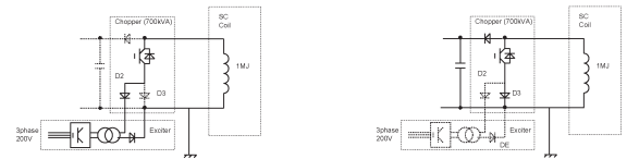
(a) Current flow while utility grid is in operation (b) Current flow when utility grid is down