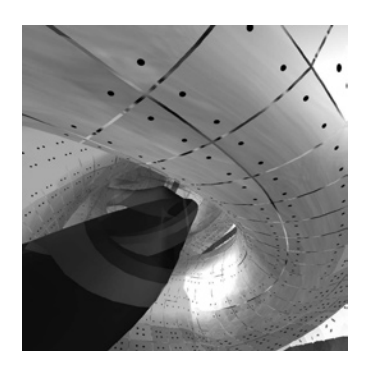
Fig. 3: CAVE visualization of VLHD and LHD VR vessel.

We succeed in visualizing both simulation results and experimental device data simultaneously in VR space. Figure 3 shows an example of simultaneous visualizations (Virtual LHD and LHD vessel). Virtual LHD is a software which can show magnetic field lines, particle trajectories and isosurface of plasma pressure based on the data by MHD equilibrium simulation [3]. LHD vessel is objectively visualized based on the CAD data. By using this simultaneous visualization, it is possible to grasp the relationship of positions between the device and plasma in the VR space.