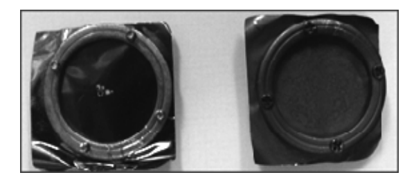
Fig.1 10µm Tantalum foil mounted in copper gasket.

An IR imaging video bolometer is a measuring instrument for plasma radiation. The performance of an imaging bolometer is dependent on the thermal characteristic and photon absorptive property of the bolometer foil<sup>1-2)</sup>. We measured the thermal characteristics of foils that have different materials. thicknesses and surface conditions in order to find the bolometer foil material which has the best sensitivity and time resolution<sup>3)</sup>. We irradiated the foils with a He-Ne laser and measured the change in temperature distribution with an IR camera. As for foil materials, W, Ta, Au and Pt, were employed. Foils were blackened either on both sides or on one side by carbon in order to improve the IR emissivity for the IR camera measurement and to increase the absorption of the He-Ne laser. The thickness of the foils ranged from less than 1 to 10µm depending on the material. Fig.1 shows Ta foil mounted in copper gasket.