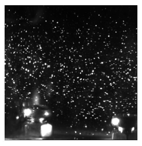
Figure 2 Tracer particles in liquid He at 1.6K.

CCD camera ( 1018 \times 1008[pixels] ) is used for visualizing the area 47[mm] \times 47[mm] . Double pulse YAG laser is operated to generate the laser sheet whose thickness is about 1[mm]. We used the polystyrene microspheres whose density is \rho_p = 145[kg/cm^3] and the diameter is d_p = 50[\mu m] . Figure 2 shows the visualized particles. They are carried by the thermal counter flow jet, but small density difference from the density of super fluid, the particles goes down gradually. We are thinking that this point should be improved in the next experiment.