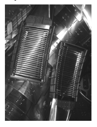
Fig. 1 HAS antenna in LHD

Through the discussion of the workshop the useful information for the research on ICRF heating was shared by many participants.