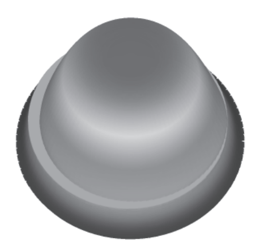
Fig.1 : Bird's eye view of equilibrium pressure profile at z=0 cross section for \beta_0=1.5\% and \Psi_b=1.0\times 10^{-3} .

2) K. Saito, K. Ichiguchi and R. Ishizaki, Plasma Fusion Res. in print (2012).