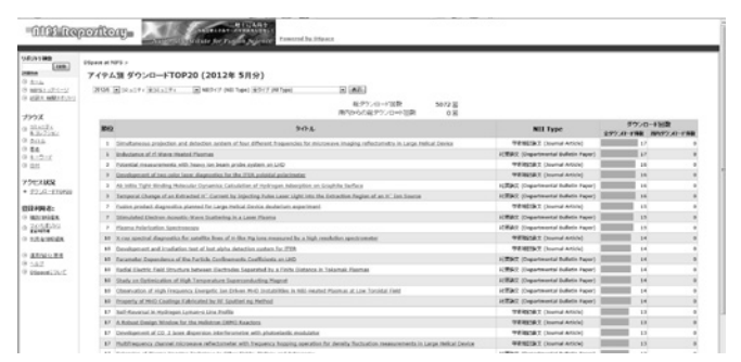
Fig. 2 A screen shot showing the TOP 20 downloaded articles.

Since FY2009 NIFS-Repository was partly supported by a grant from Cyber Science Infrastructure (CSI) Project for "Further expanding IRs and creating content" operated by National Institute of Informatics (NII). In FY2011our efforts under this grant were mainly concentrated onto enrichment of its contents in NIFS-Repository. Namely, the retroactive input of the papers from Annual report and published papers was continued. As a result, by the end of FY2011 number of contents in NIFS-Repository increased to 6,166 items, including scientific articles published in various journals, NIFS-reports and Annual Report of NIFS, and the download count of items was 36,624 in total during 2011 except October, when the server replace was done.