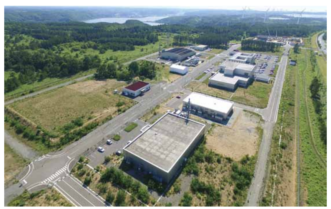
Bird's-eye view of IFERC site at Rokkasho village. The site is viewed from East to West.