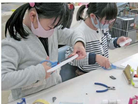
Fig. 4 Science classroom