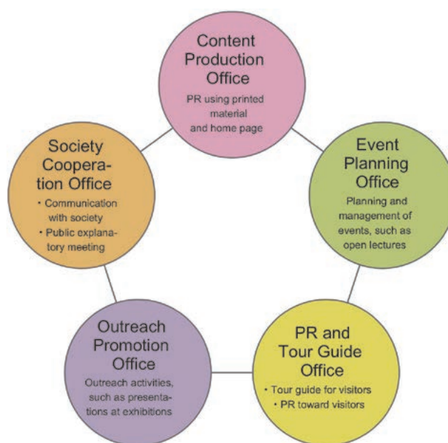
Fig. 1 Organization chart of Division of External Affairs

The Division of External Affairs, as a core organization responsible for public relations and outreach activities, promotes “dialogue” with society, including the local area, through a variety of activities. The organization underwent a review in 2019 and now consists of five offices: the Society Cooperation Office, the Content Production Office, the Event Planning Office, the Public Relations and Tour Guide Office, and the Outreach Promotion Office. A summary of the offices is depicted in Fig. 1. Many NIFS staff are active as members of the department. Its main activities are : holding academic lectures for the public (Fig. 2), providing tours of NIFS facilities (Fig. 3), and science classroom activities (Fig. 4). Face-to-face activities have been limited due to COVID-19, but new activities online have been initiated.