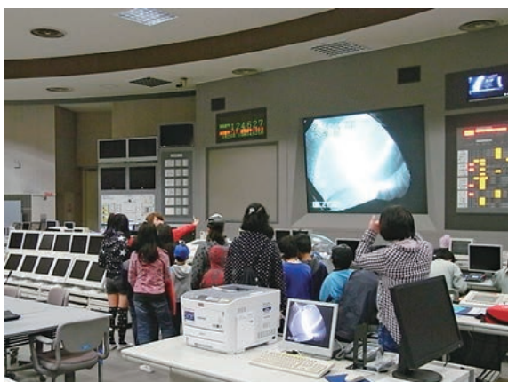
Fig. 3 Tour of NIFS facilities