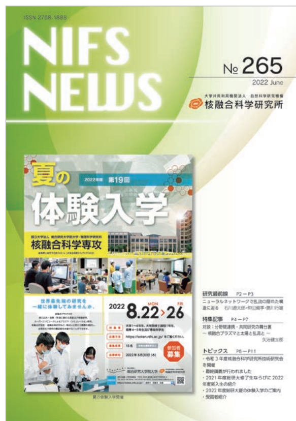
Fig. 5 Public relations magazine: NIFS News