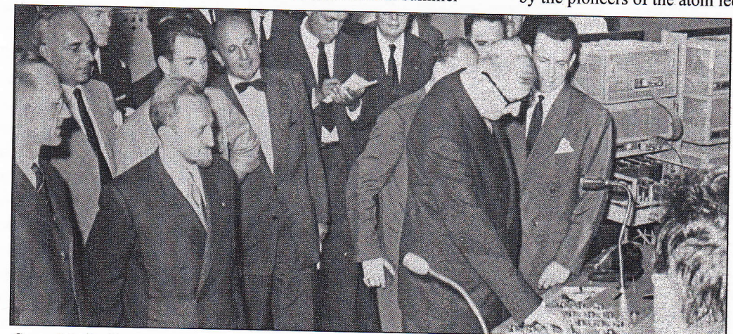
General de Gaulle visiting Marcoule on August 2, 1958

Extraction of plutonium from the irradiated spent fuel in G1 to meet for the country's commercial and defense requirements began when the UP1 reprocessing plant was commissioned in July 1958. Here again, the work accomplished by the pioneers of the atom led