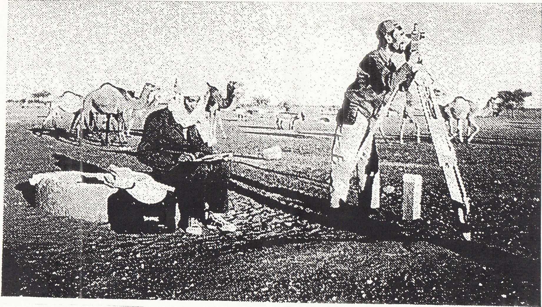
J-F Joint Prospect for Uranium, Niger, 1970 ~