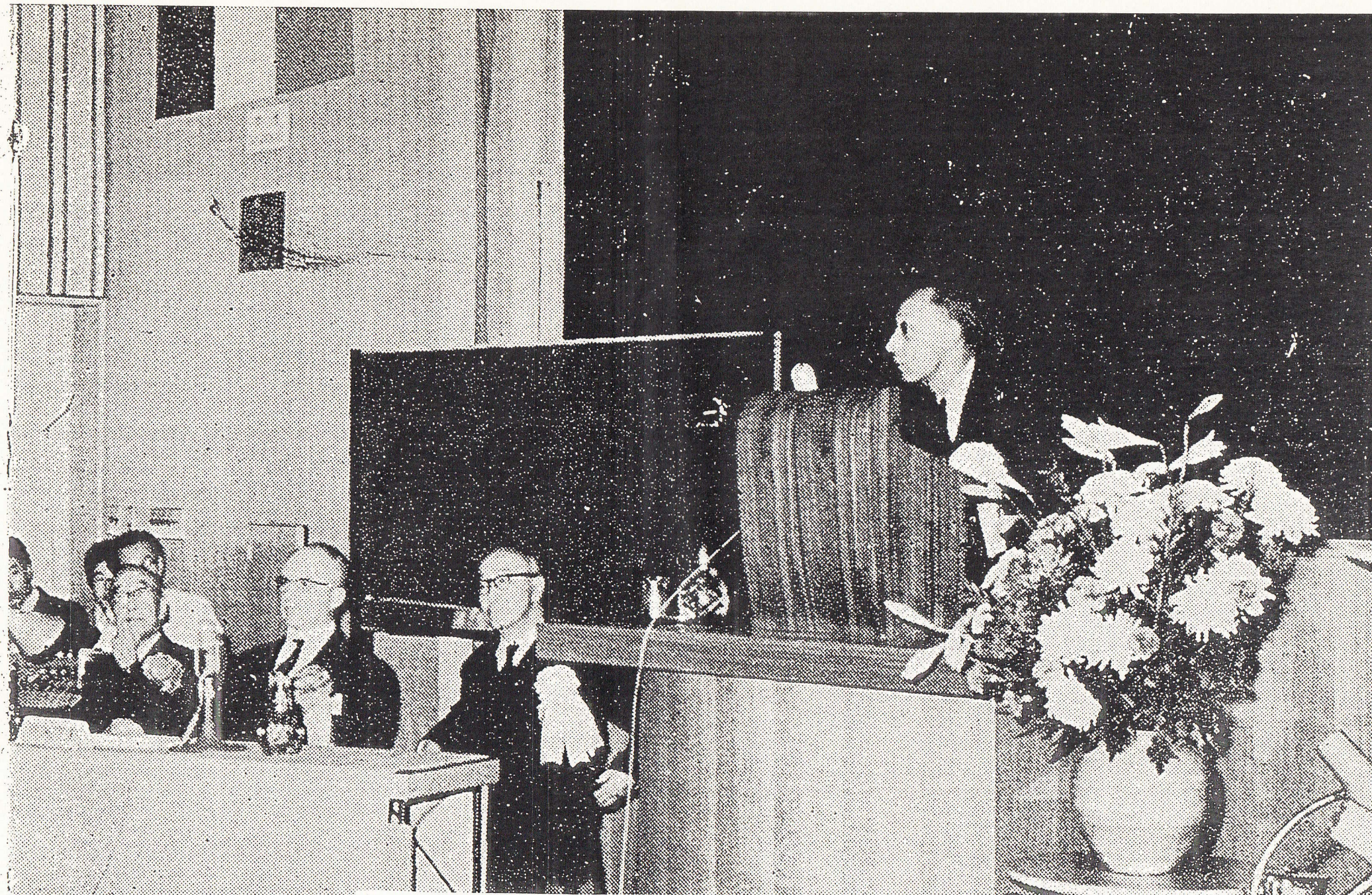
1 st Nuclear Technology Conference, Japan, 1962