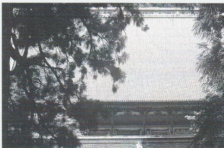
Cover : Tiled Roof of the Konpon Chudo Hall of the Temple Hieizan Enryakuji

Konpon Chudo, an all 'keyaki' wood building standing as the central hall of Hieizan Enryakuji, has a flame kept burning for 1,200 years as the light of Buddhism. It was not totally put out even when the temple was set on fire by Oda Nobunaga in 1517, for a part of the flame was moved to Risshakuji, a temple in Yamagata Prefecture, to keep the light of Buddhism burning there. Sixty years after the temple was burned down, Iemitsu, the third 'shogun' of the Tokugawa line, spent eight years getting it rebuilt in 1642 and the light returned there from Risshakuji. Not a day has been without a supply of rapeseed oil to keep the light burning to date.