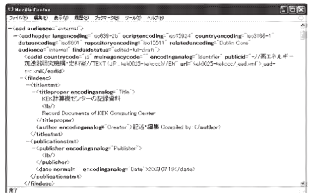
Fig. 3 An Example of exported EAD/XML file

The constructed EAD form for individual collection is put into a file by 'export' utility of the FMP. Last technical remark to this method may be important: the FMP internally uses special 'Line Feed' character, '0D' in HEX, and it has to be replaced by ordinary <LF> (and/or <CR>) to be interpreted as XML properly. For this, independent program has been made. A sample of the EAD by this method is shown in Fig. 3. The method requires more tunings to complete.