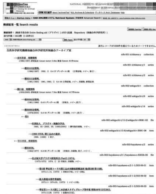
Fig. 2 A screen view of EAD-XML-based information retrieval system. Here one may see the hierarchy structure.

This work was conducted under NIFS Collaborative Research Program (NIFS07KVXJ010).