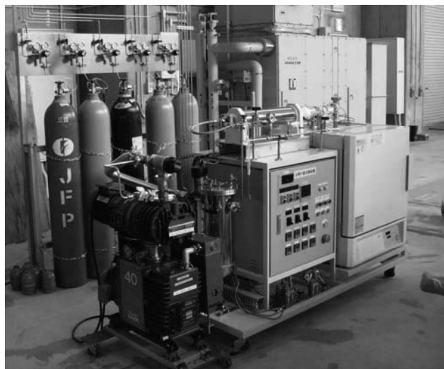
Fig.1 The photograph of the MOCVD apparatus for the large area oxide coating in NIFS.

We have constructed MOCVD apparatus to demonstrate synthesis of \text{Er}_2\text{O}_3 oxide layer on the large surface area of metal and single Si substrate. The photograph of MOCVD apparatus is shown in fig. 1. The MOCVD apparatus consists of three main components; the metal organic supplying line with a vaporizer, a gold furnace type quartz tube reactor and an exhaust system. The metal organic complex was vaporized at 200 °C in the vaporizer and introduced into the reactor by the argon carrier gas. All supplying lines were heated at 250 °C by the ribbon heater to prevent the metal organic complex solidification. The vaporized complex reacted with oxygen gas via the other supplying line and the oxide coating layer was grown on the various substrates. In this