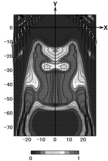
Fig.2 Kinetic region in the earth equatorial plane where color map stands for the value of \rho_i |J/B| .