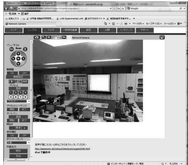
Fig.1 web camera installed in the control room

In order to send the video images using IP multicast, the author have tested a network camera that had a GigE Vision interface. GigE Vision is a standard interface to control the network attached video camera. In order to develop an application to control GigE Vision application,