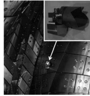
Fig. 1: The retroreflector installed in LHD

In conclusion, the reflectivity of the retroreflector in metal and carbon devices seems to be determined by the hydrogen glow discharge. Contributions of the main discharges and the glow ones with other gases were small. Close of the shutter during only the hydrogen glow discharge would be effective to maintain the reflectivity if possible.