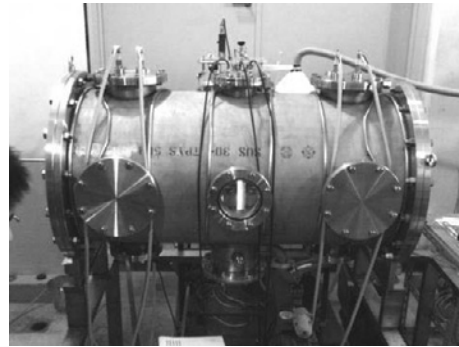
Fig. 1 Constructed double plasma device.