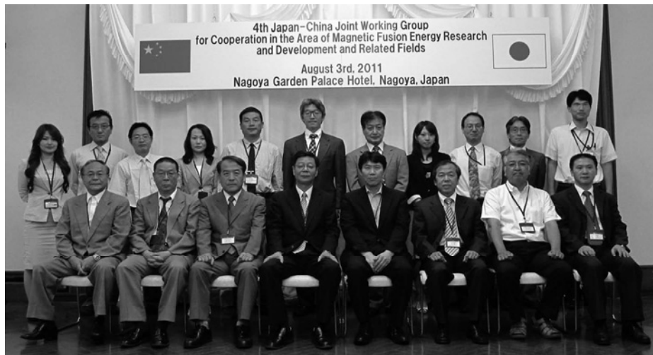
Fig. 2 Participants of JWG-4 in Nagoya Garden Palace Hotel (3rd August 2011).