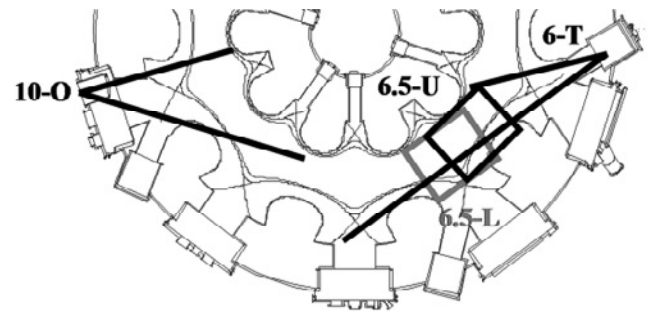
Fig. 1. FoVs of four IRVB systems in LHD