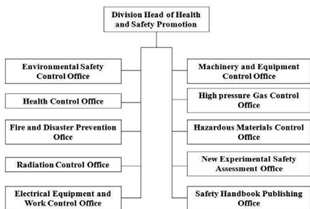
Fig. 1 Division for Health and Safety Promotion

The Division for Health and Safety Promotion is devoted to preventing work-related accidents, to ensure safe and sound operation of machinery and equipment, and to maintain a safe and healthful environment for researchers and technical staff. The division is composed of ten offices, as shown in Fig. 1. The division for health and safety promotion conducts the environmental safety, environmental hydraulics monitoring, radiation monitoring, safety education and radiation training. Furthermore, the division for health and safety promotion patrols around the working areas every week during maintenance term.