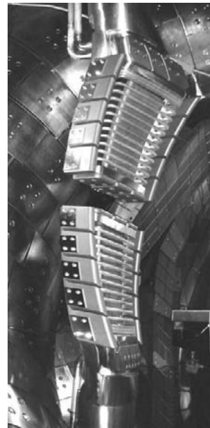
Fig. 1 FAIT antenna in LHD

The loading resistance of 6\ \Omega was attained by increasing electron density more than 2 \times 10^{19}\ \text{m}^{-3} with the standard antenna position where the shape of antenna head was designed and the distance between Faraday shield and last closed flux surface is 5.8 cm. Heating efficiency was estimated by using the power modulation. It reached 85 % when the minority ion ratio was properly adjusted. When the current phase between antenna loops was swept by 360^\circ , power reflection ratio was less than 10 % without impedance matching. This means that mutual coupling between antenna loops is low enough for easy impedance matching. Present maximum injected power per one antenna is 1.13 MW for short pulse. This is limited by the output power of transmitter. The transmission line voltage of 38.5 kV was achieved, which means that the high injection power of 1.78 MW will be possible with the loading resistance of 6\ \Omega . Then the power density will reach 15\ \text{MW/m}^2 .