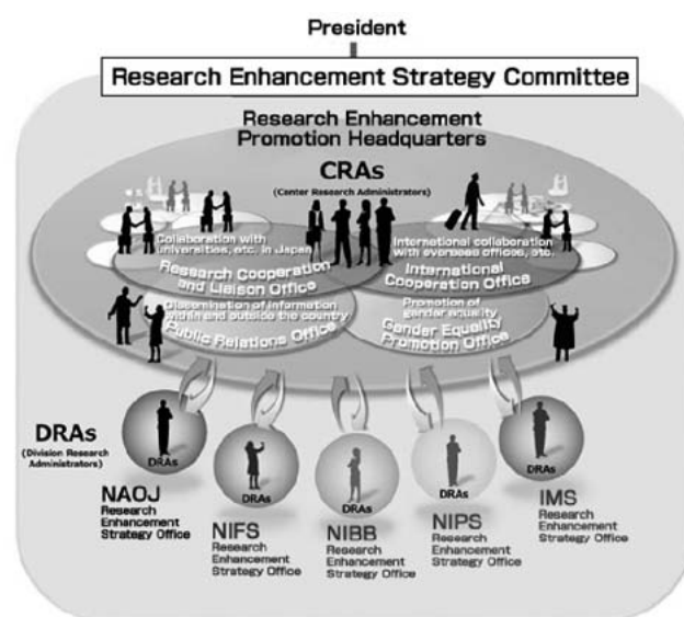
Fig. 1 Organization Structure

Also, in order to encourage the acceptance of foreign researchers, the NINS will recruit brilliant young researchers from other countries and encourage international collaboration projects by putting out international announcements, etc., as well as supporting the improvement of the research environment for foreign researchers and graduate students the NINS employed.