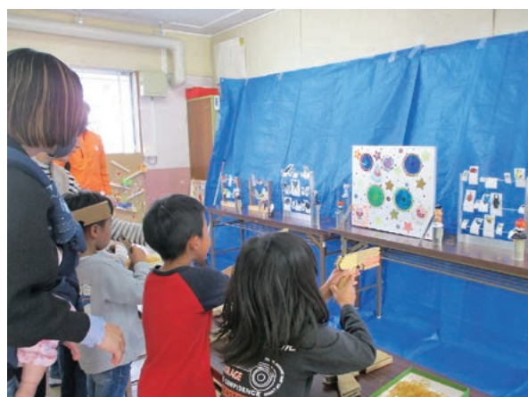
Fig. 5 Scientific classroom