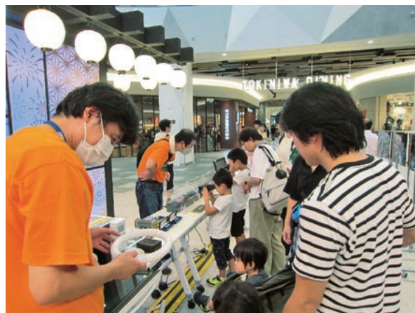
Fig. 3 Scientific events in shopping malls, “Machikado (street corner) Science Lab”