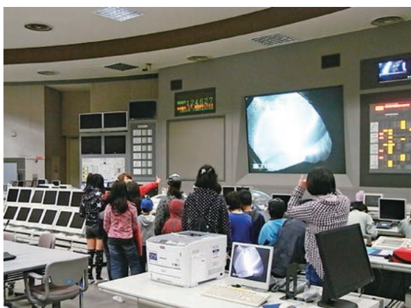
Fig. 4 Tour of the NIFS facilities