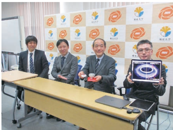
Fig. 2 Press release